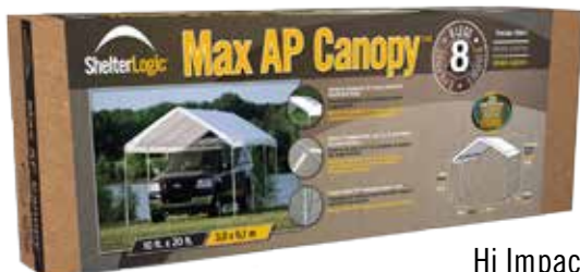
Hi Impact Wrap Label Packaging

QUICK & EASY SET UP - With built in slip fit swaged tubing. Wide foot plates on every leg add stability/easy anchor points.