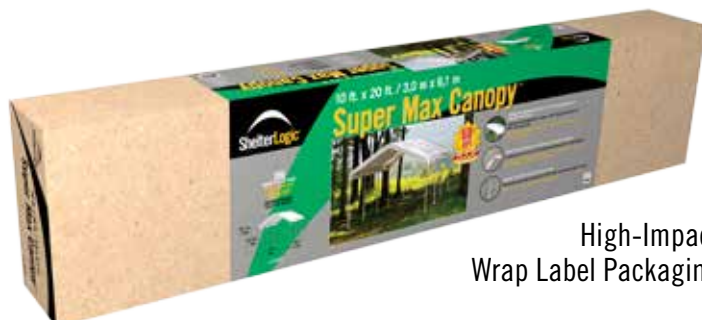
High-Impact Wrap Label Packaging

QUICK & EASY SET UP - With built in slip fit swaged tubing. Wide foot plates on every leg add stability/easy anchor points.