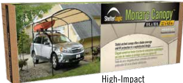
High-Impact Wrap Label Packaging

BOLT-TOGETHER ROOF CONNECTIONS - mean a tighter, stable, more solid structure.