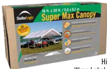
High-Impact Wrap Label Packaging

QUICK & EASY SET UP - With built in slip fit swaged tubing. Wide foot plates on every leg add stability/easy anchor points.