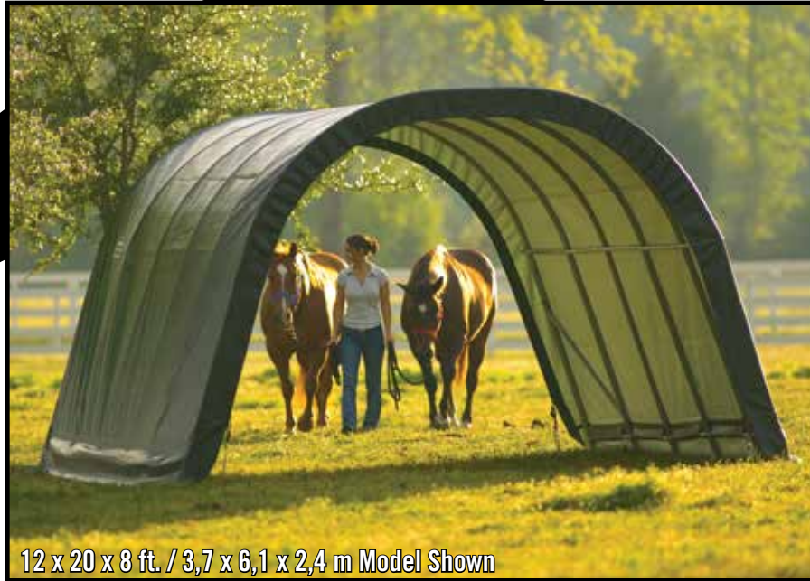
12 x 20 x 8 ft. / 3,7 x 6,1 x 2,4 m Model Shown