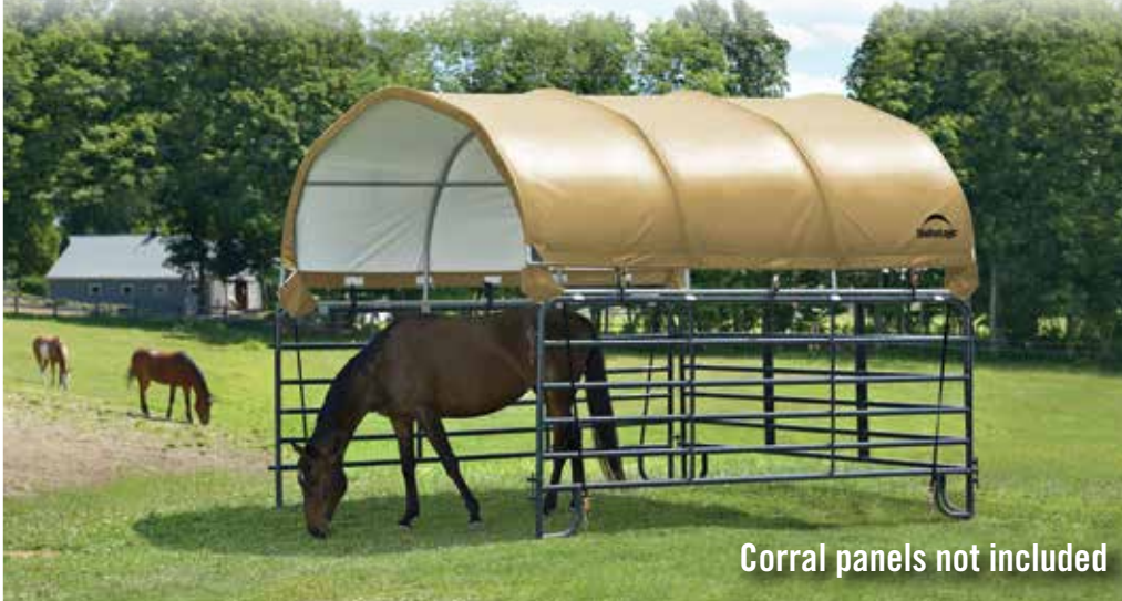
Corral panels not included

A cover for corral panels to shade and protect livestock.