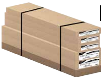
EASY DROP SHIP PALLET PACK Pre Palletized 5 Box Unit