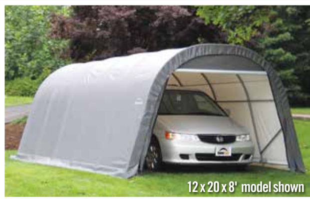
12 x 20 x 8' model shown

Thousands of options to custom fit your storage needs.