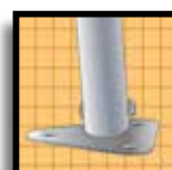
Steel foot plates