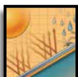
UV treated fabric