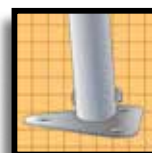
Steel foot plates