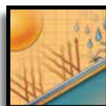
UV treated fabric