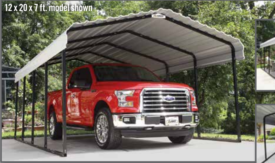
12 x 20 x 7 ft. model shown

Multi-use shelter and carport – perfect for vehicles, boats, tractors, and outdoor picnic areas and patio furniture.