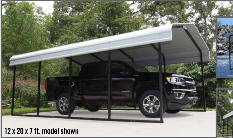
12 x 20 x 7 ft. model shown

Multi-use shelter and carport – perfect for vehicles, boats, tractors, and outdoor picnic areas and patio furniture.